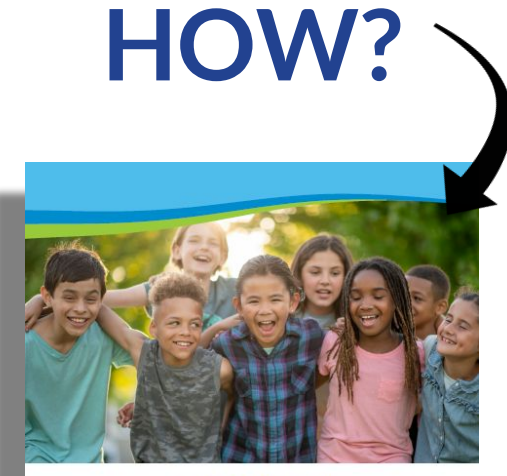
ROADMAP FOR School Mental Health Improvement

The <u>Wisconsin School Mental Health Framework</u> outlines six components of high quality school mental health systems. The <u>Roadmap for School Mental Health</u> <u>Improvement</u> breaks down five steps for improving the quality of a school's current mental health supports. Together they provide a flexible approach to promoting student and staff well-being and more equitable outcomes for Wisconsin Students.